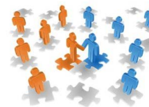
Making the Pieces Fit