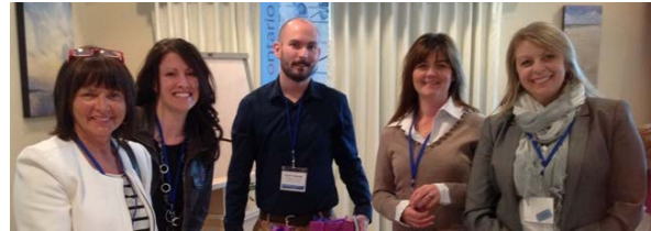
Panel participants from four DCO centres discussing best practices in Trauma Informed Support.

This year's 2014 DCO spring conference was held in Cambridge, Ontario April 24-25. The conference planning team selected Trauma Informed Support as this year's theme to highlight the importance of understanding trauma and its effect on individuals, both in the immediate and long term.